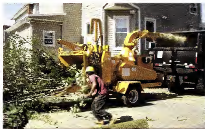
Figure 6. In the training sessions, tree industry representatives learn about the ALB and how to identify its damage.